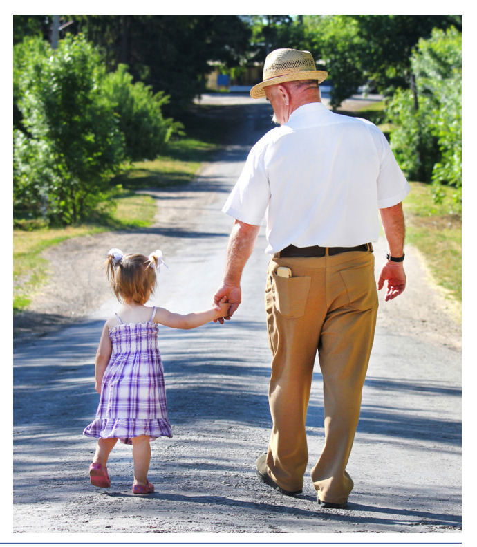
Texans Care for Children

The Legislature deserves credit for making significant progress this session, but the state's troubled foster care system will not get fixed overnight. There will be more work to do in the interim and during the next legislative session to ensure more kids can stay safely at home with their families and ensure that children who do enter the CPS system receive the attention and support they need to succeed.