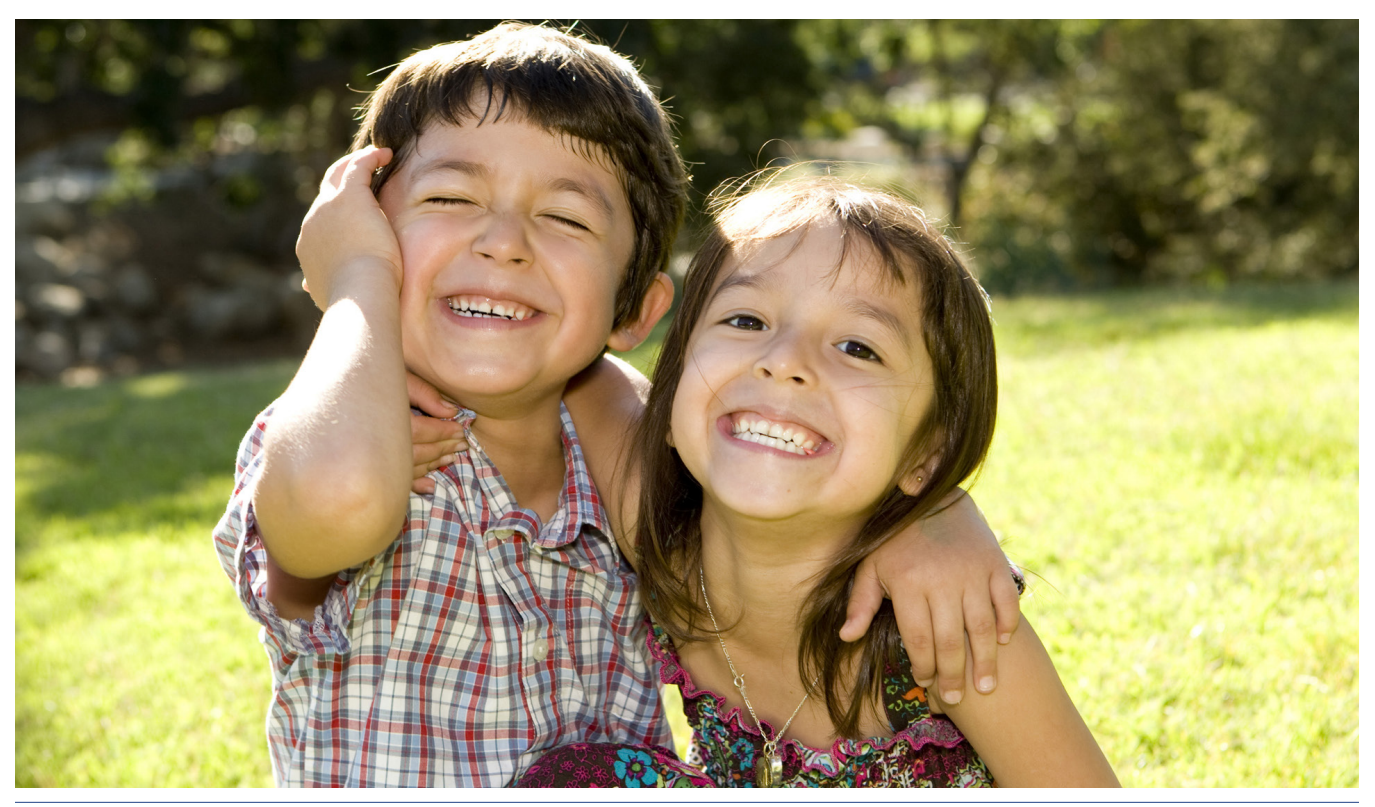
Review of Child Protection Policy and the 2017 Legislative Session

To further address the capacity challenge, the budget and SB 11 support the expansion of