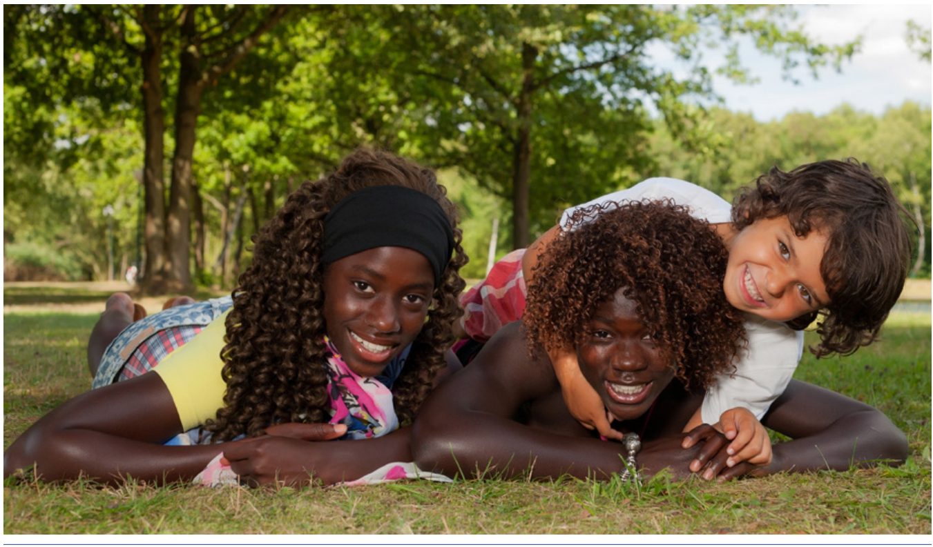
Texans Care for Children

Under SB 11, Texas will now assess penalties against Child Placing Agencies (CPA) and MCOs if children in foster care do not receive health screenings in a timely fashion. In communitybased foster care regions, the Child and Adolescent Needs and Strengths (CANS) assessment will be conducted every 90 days for children with higher levels of need to ensure the care they are receiving leads to better outcomes.